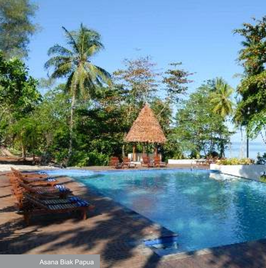
Asana Biak Papua