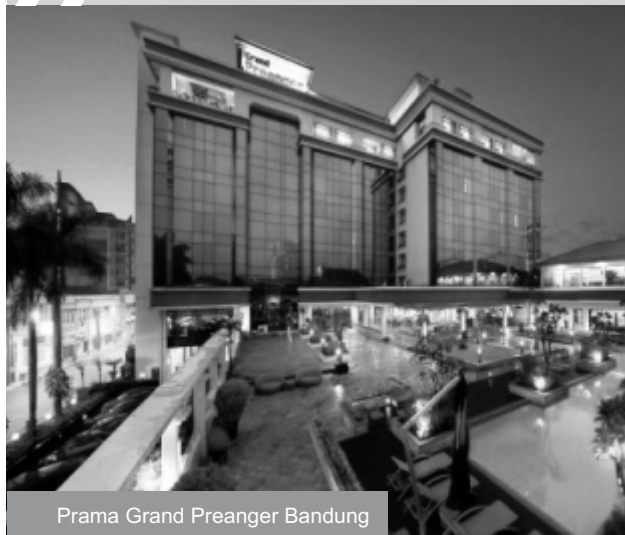
Prama Grand Preanger Bandung

The word Prama means excellence, crowned by a shape that reflects the characteristics of the upscale brand