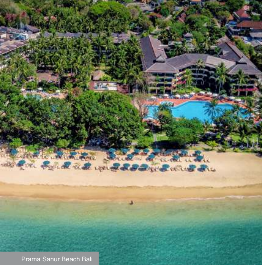
Prama Sanur Beach Bali