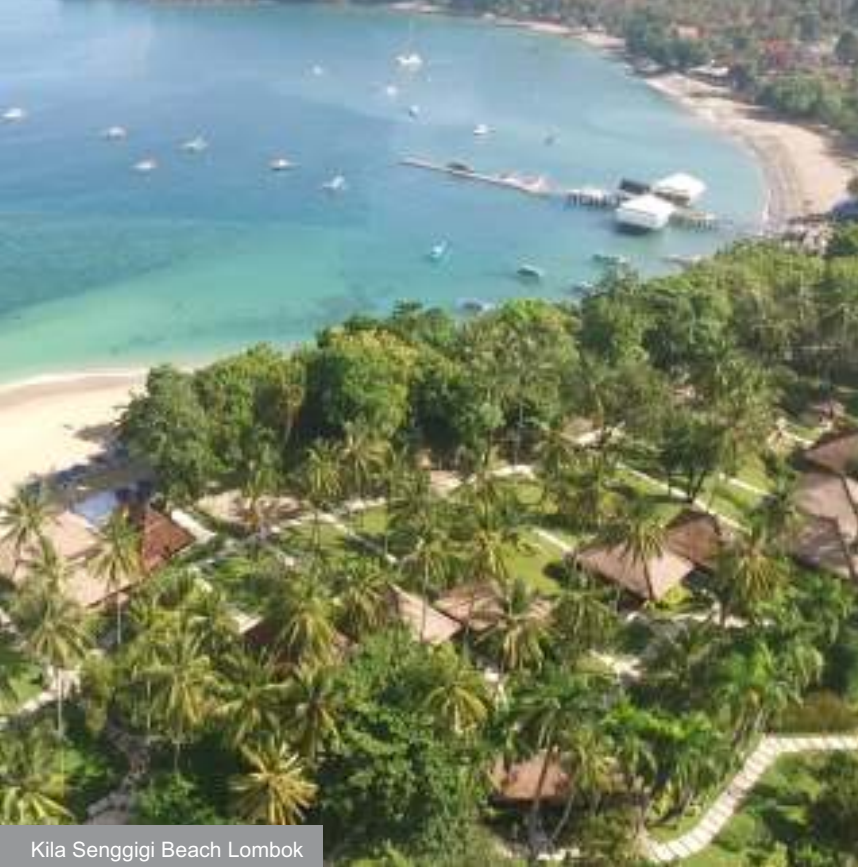
Kila Senggigi Beach Lombok