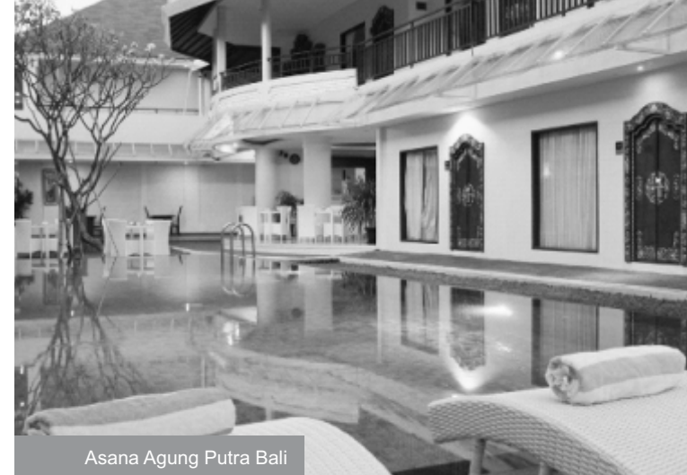
Asana Agung Putra Bali

Asana is very harmonious for hotel guests who stay one or two days only, so it does not require fancy and complete facilities. The hotel's location, cleanliness and affordability are key elements for guests in choosing accommodation in this category. Asana hotels scattered in various regions in Indonesia, namely Asana Kawanua Jakarta, Asana Biak Papua, Asana Agung Putra Bali, Asana Sincerity Dorm and 3 new establishment under Asana Brand are Asana Nevada Ketapang, Asana Grand Pangrango Bogor and Asana Puri Garden Semarang.