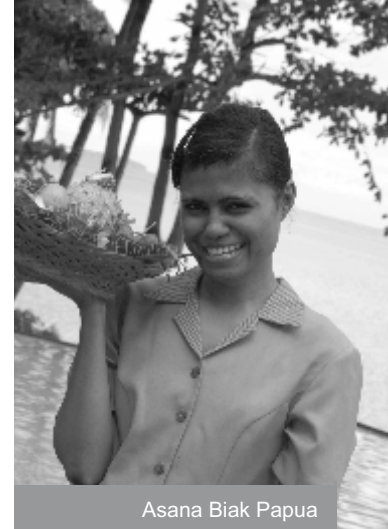
Asana Biak Papua

Aerowisata Hotels & Resorts has come a long way since building its first hotel back in 1974 in Sanur Beach Bali. We are a division under PT Aerowisata, a hospitality company and a subsidiary of PT Garuda Indonesia, adhering to international standards as it evolves into an Indonesian hotel chain that offers caring hospitality and generous services. The worldwide network and the substantial support from the group, particularly with PT Garuda Indonesia as the holding company of PT Aerowisata, further add to the strengths of Aerowisata Hotels & Resorts.