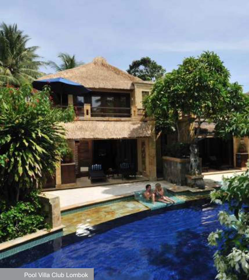
Pool Villa Club Lombok