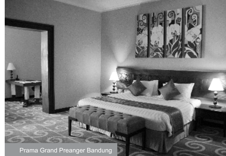
Prama Grand Preanger Bandung

Hotels in Prama category aiming individual travelers as well as families, business leaders who want to attend Business Meetings and MICE. Reserved for guests who need a strategically located, luxurious facilities and environmentally friendly hotel. Those are: Prama Sanur Beach Bali and Prama Grand Preanger Bandung