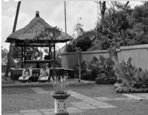
Pool Villa Club Bali

Reinventing Hotel Management with Authentic Indonesian Hospitality