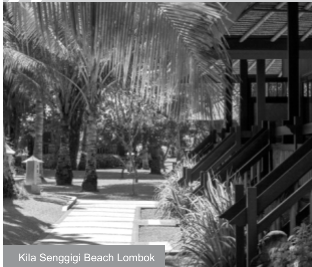
Kila Senggigi Beach Lombok

Carrying the meaning of bright and shining, Kila is heightened by a symbol inspired by the plumage of peacocks that shines in a naturally alluring way.