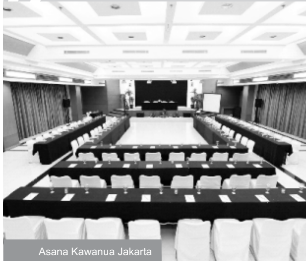
Asana Kawanua Jakarta

Asana in short for Akrah (Cordial), Santun (Polite) and Mempesona (Enthralling). These qualities are summed up within a symbol that conveys an amicable, refined and charismatic persona imbued with sensitivity and gentleness.