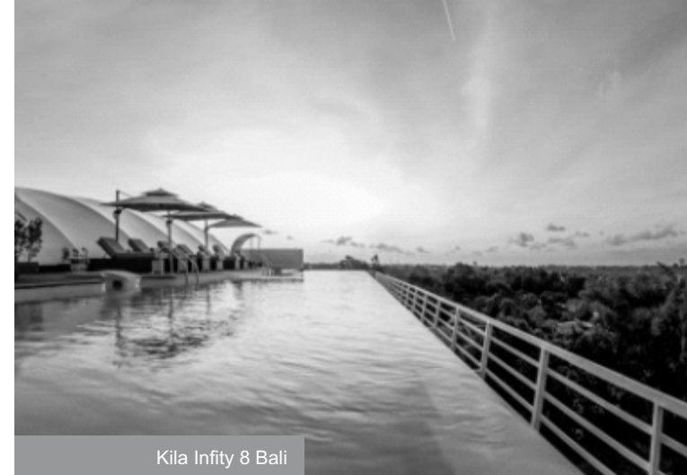
Kila Infinity 8 Bali

Market segmentation for Kila is for individual travelers as well as families and business people who will be attending business meetings / MICE. However, in addition of location and facilities, guests also still considering the competitive price offered by the hotel. Included in this category are the Kila Senggigi Beach Lombok and Kila Infinity 8 Bali.